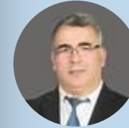
Pr Nouar Tabet