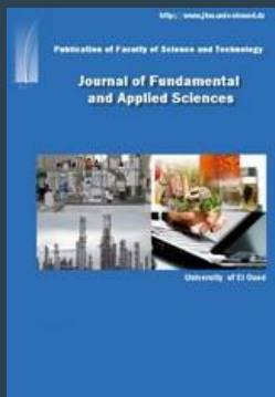
Journal of Fundamental and Applied Sciences