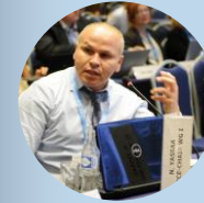
Pr Yassaa Nouredine