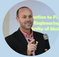
Pr Saad Mekhilef