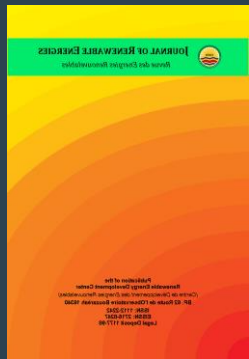
Revue des Energies Renouvelables

Selected papers will be published in Revue des Energies Renouvelables and Journal of Fundamental and Applied Sciences